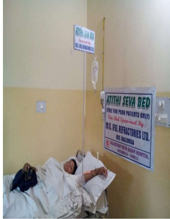
Free Bed at Rajasthan Seva Sadan, Rourkela