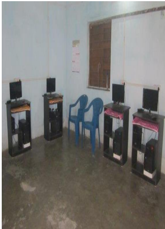
Priyadarshini U P School, Kalunga