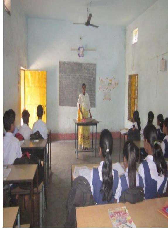
Kalunga Shilpanchala School