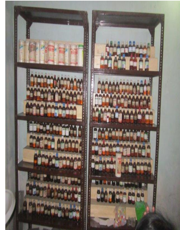
Free Homeopathic Clinic, Farshatolla, Kalunga